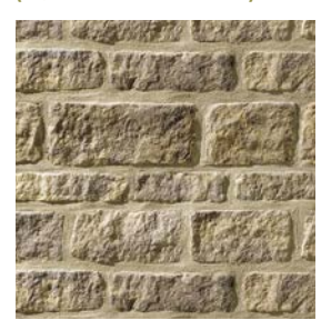
SOUTHWOLD (ROUGH DRESSED FINISH)