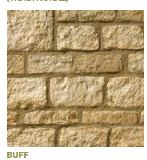
(ROUGH DRESSED FINISH)